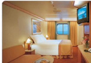
Ocean View Stateroom

4B Riviera Deck $695 4C Main Deck $735 4D Empress Deck $745